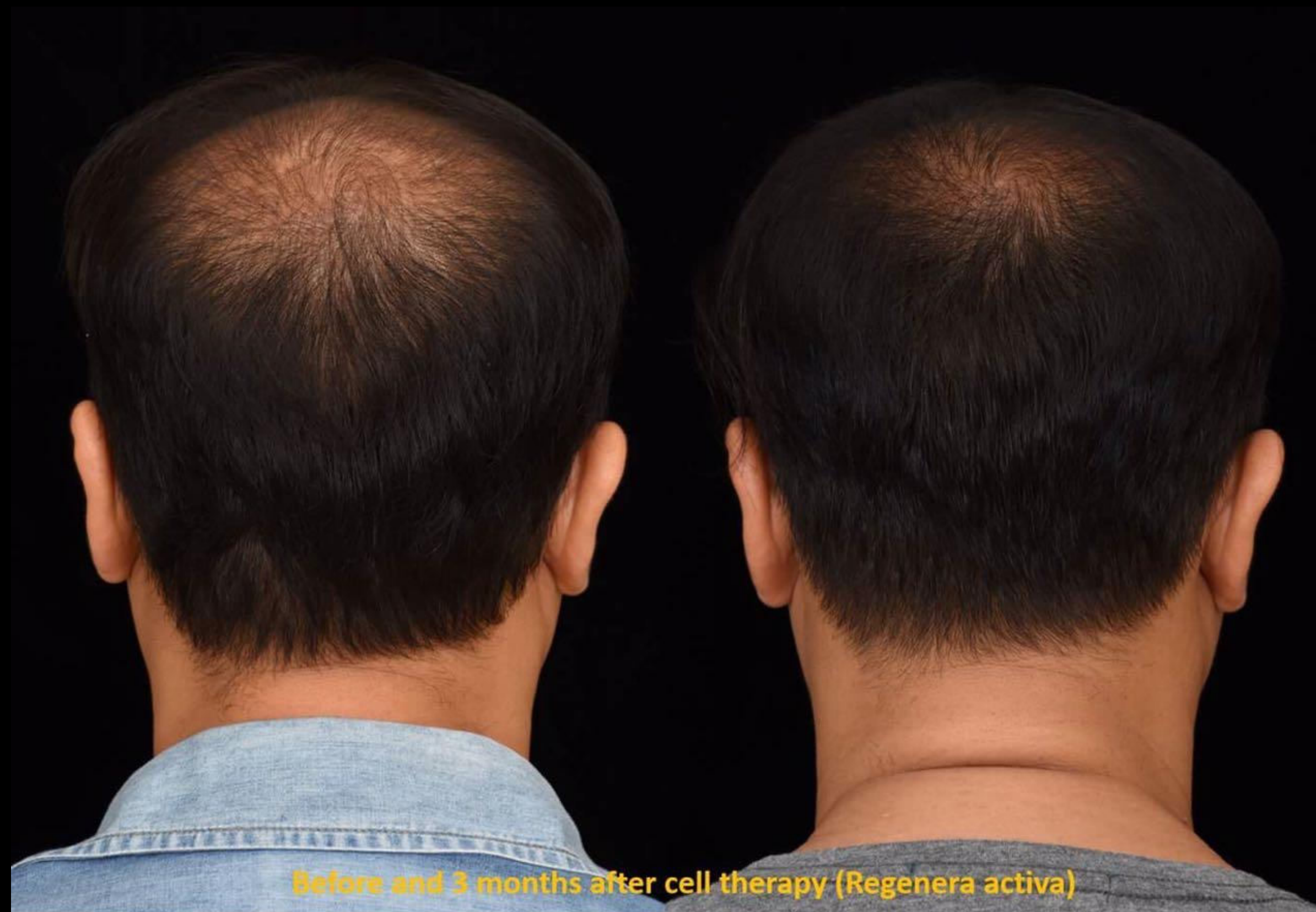
Before and 3 months after cell therapy (Regenera activa)